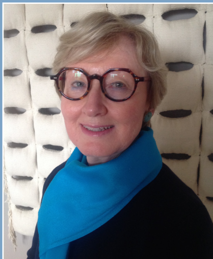
Wexford Inc. Senior Researcher