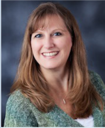
Baldwin City USD #348 Director of Curriculum, Instruction, & Assessment