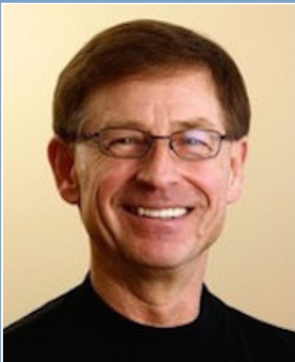
University of Kansas Center for Research on Learning Director, KUCRL Senior Scientist