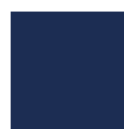
True Navy PMS 5255C