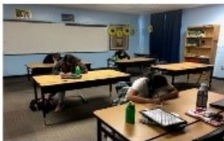
Junior High Students writing cards to Nursing Home residents.