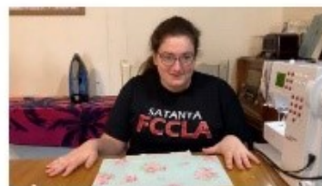
Making masks, due to COVID.