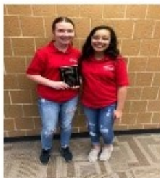
Middle School Community Service