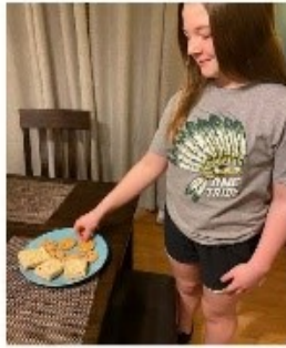
Cookies for Hospital workers.