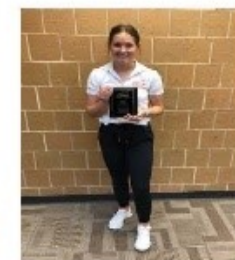
High School Community Service