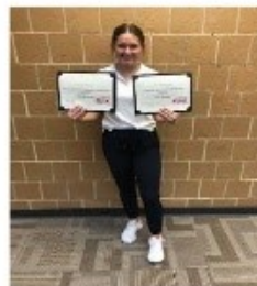
Chapter Awards at Kansas State FCCLA Convention Scholarship Award Winner