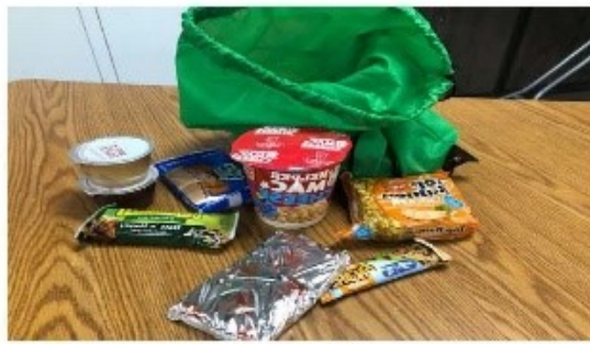
Contents of backpacks given to students.