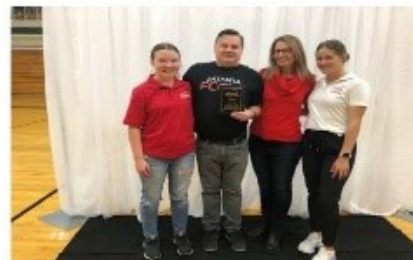
State Family of the Year