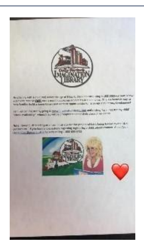
Sunday Snuggles (a family connection with Facebook Live) - offers a book to every student to read at home while the principal is reading the book aloud on Facebook Live.