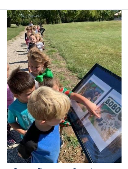
Garnett Elementary School students have an opportunity to read new books while getting physical activity with the new community StoryWalk.