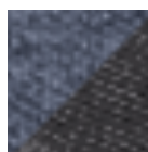
Estate Blue Heather/ Charcoal Heather