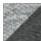
Medium Heather Grey/ Charcoal Heather