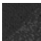
Deep Black/ Charcoal Heather