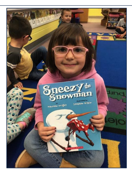
Early learners in Ulysses USD 214 and community preschools have new books and activities with LiNK funding.

Families also can access the new Little Library at Hickok Elementary for children of all ages.