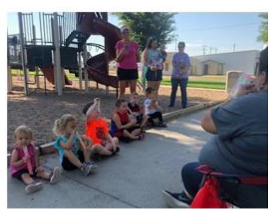
The LiNK grant provided children with books and activities throughout the community, as well as professional development for educators to enhance their foundational reading teaching skills.