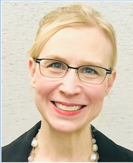
Kansas State Department of Education Literacy Network of Kansas, Project Director