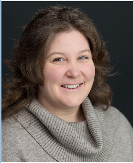
Emporia State University The Teachers College Assistant Professor