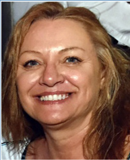
Kansas State Department of Education Assistant Director of Early Childhood, Special Education and Title