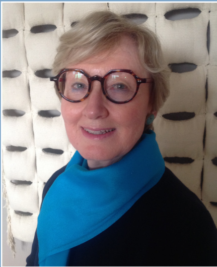
Wexford Inc. Senior Researcher