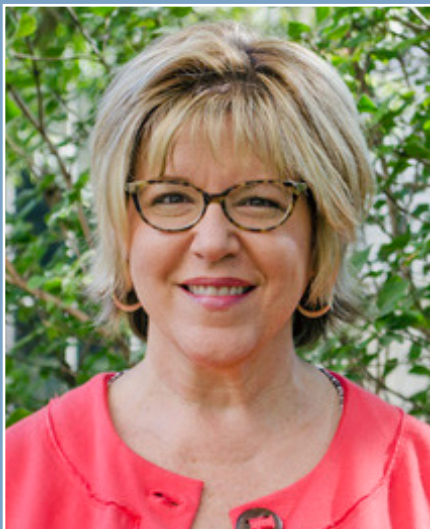
Kansas State University College of Education Department of Curriculum & Instruction Assistant Professor