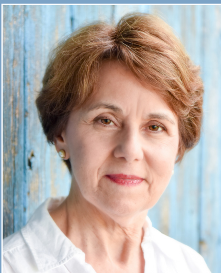
University of Kansas Professor Emerita